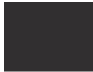
DOUBLE PAGE SPREAD