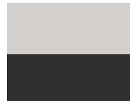
DOUBLE PAGE HALF SPREAD